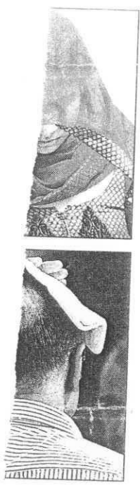
Mercury remained high and temperature was...

Commuters said the long journey between New Delhi and the airport now took more than 30 minutes. "The slow movement of trains is causing a massive delay in train services. It has become synonymous with the Airport Metro Express."